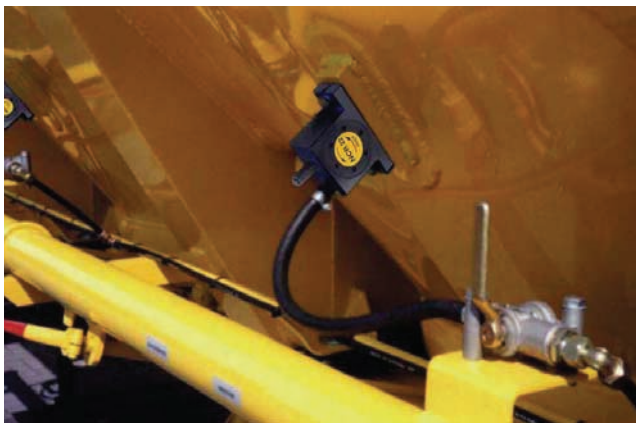
Emptying silo trailers