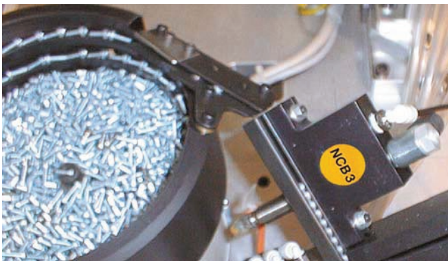
Sorting and aligning

*Dimensions for horizontal mounting, bore ØE