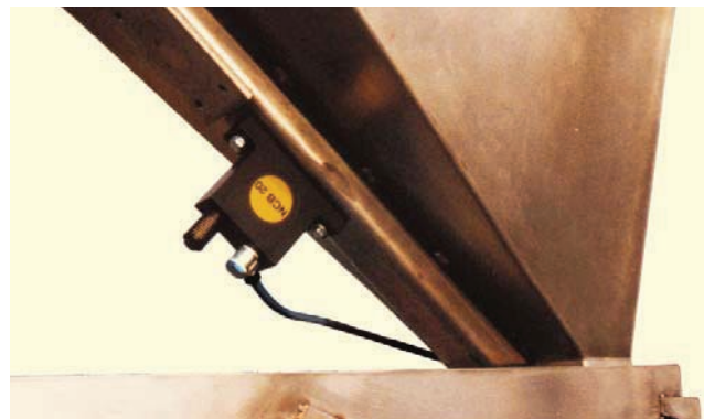
Emptying without bridging